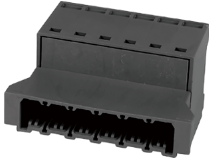
Twin connectors design, the pole number is half of the total connection points. The photo shows a 12 connection product, the pole number is 06.