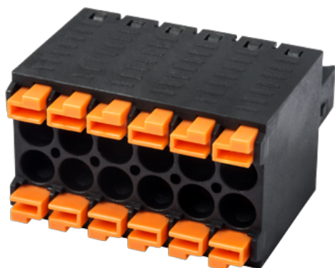
Twin connectors design, the pole number is half of the total connection points. photo shows a 12 connection product, the pole number is 06.