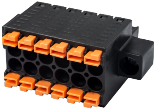
Twin connectors design, the pole number is half of the total connection points. photo shows a 12 connection product, the pole number is 06.